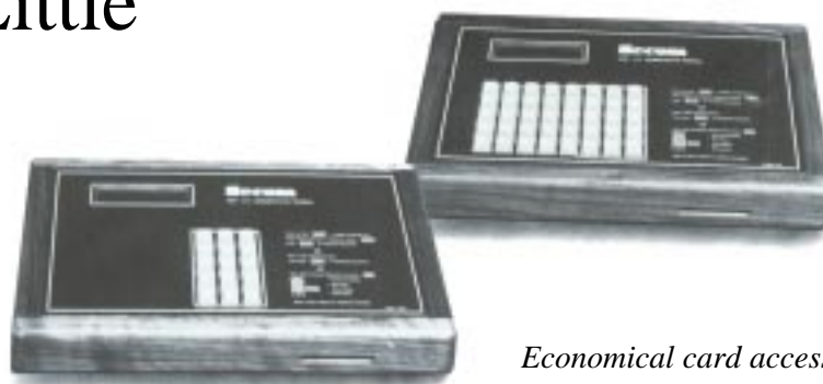
Economical card access and revenue controls

The basic Secontroller 15 is a versatile card access, alarm monitoring and parking revenue control system that can be enhanced with PC Admin for a personal computer interface, and DataView software for hand-off of all transaction data to a relational database for powerful, single screen query building and reporting.